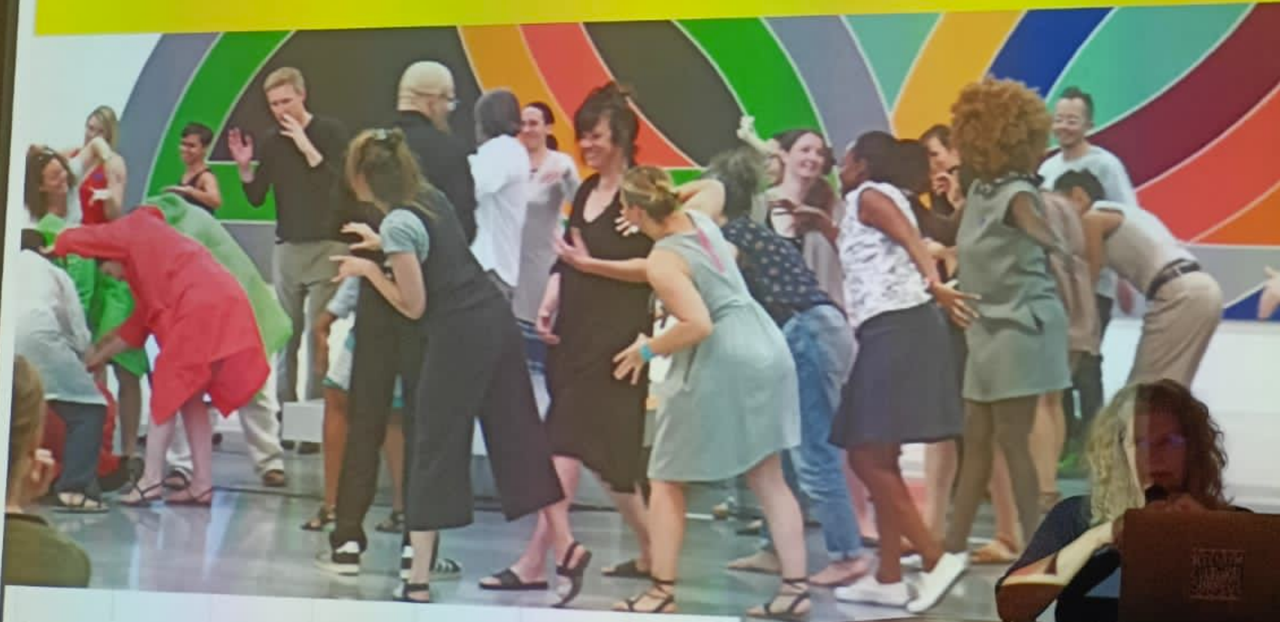
De Colonising Art Institutions, Kunstmuseum Basel